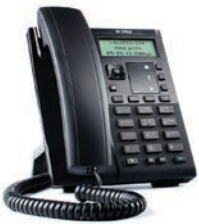
Mitel 6863 SIP Phone

This 2-Line SIP phone with 2.75" graphical monochrome LCD display, programmable hard keys, and smaller desktop footprint is an ideal option for business environments that have light telephone use requirements.