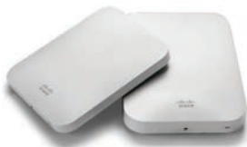
MR Wireless Access Points

Access points are built from the highest grade components and carefully optimised for a seamless user experience enabling faster connections, greater user capacity, more coverage, and fewer support calls.